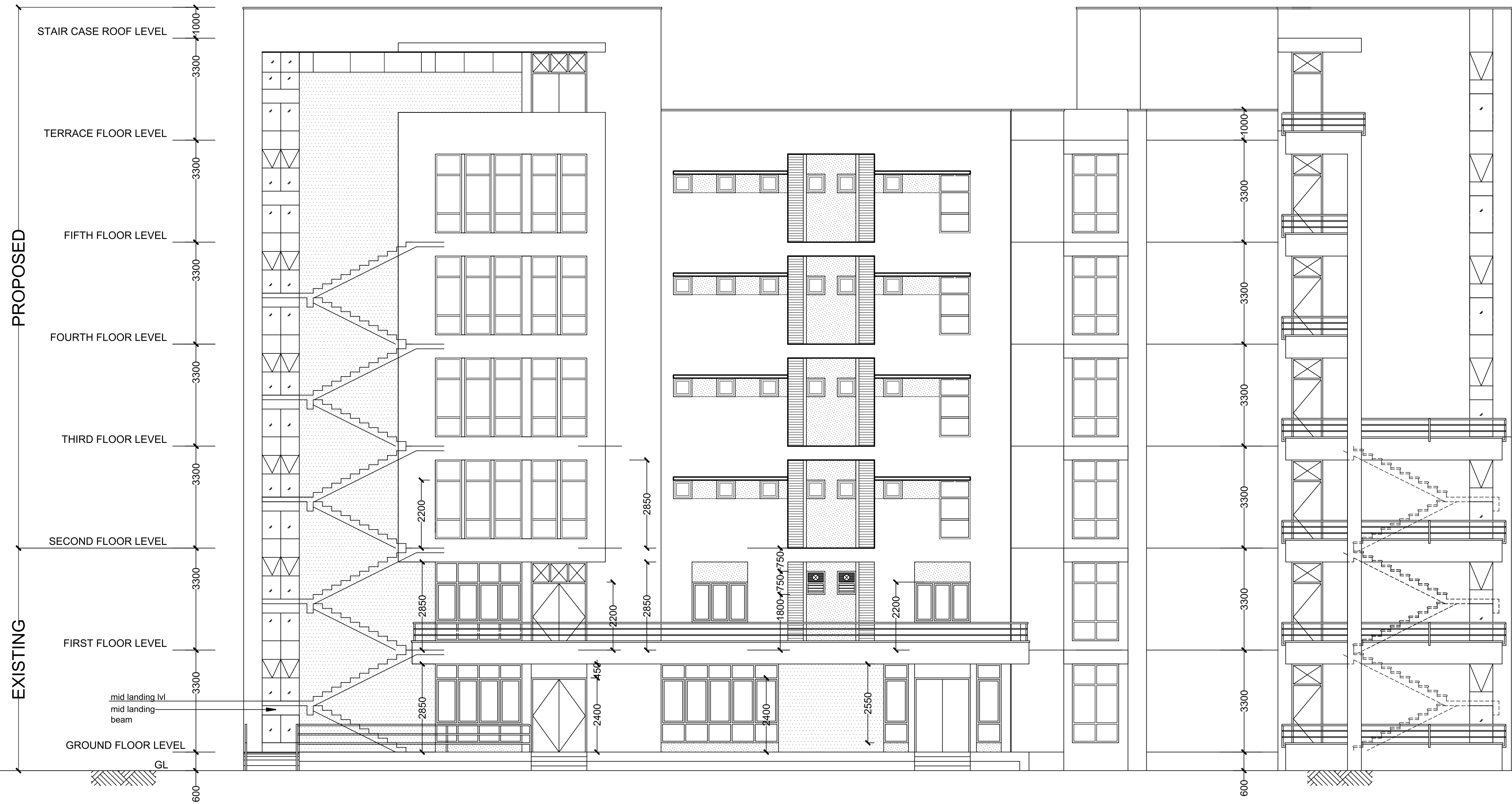
NORTH SIDE ELEVATION