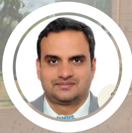
Shri Anupam Mishra