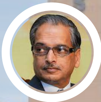
Hon'ble Justice R.K. Agrawal President, National Consumer Disputes Redressal Commission, New Delhi